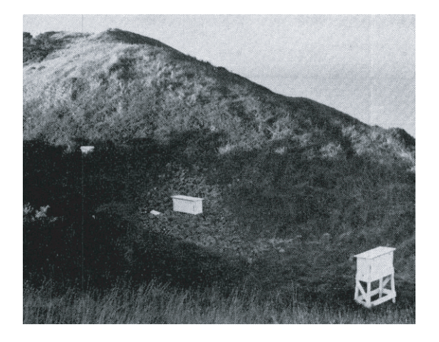
FIGURE 1. Stephens Island frog bank showing part of the climate-measuring equipment. Screens from left to right: stations 5,4,3 and 2 (on stand).