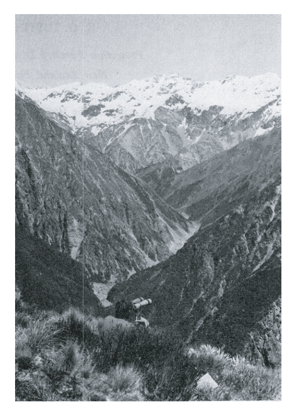
FIGURE 1. Carneys Creek catchment looking into the headwaters from above the mouth.

similar weather conditions during 24-28 February 1965, and 23-27 February 1977. The same procedures were used throughout, and one author (CNC) participated in both censuses. Observers operated separately, looking across-valley and onto adjacent faces and bluffs from an altitude of around 1500 m to 1800m (see Fig. 1), and often changing position