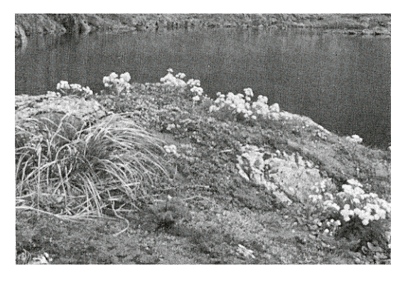
Figure 2: Anisotome haastii and Ourisia macrocarpa growing amongst Gaultheria crassa and dense mats of Hypnum cupressiforme and Racomitrium pruinosum on Island B, Faraday tarn (1 January 1995).

The most obvious impact of feral goats is on the abundance and vigour of the large herbs Anisotome haastii and Ourisia macrocarpa which were particularly abundant on three of the four islands forming tall herbfields, and were flowering profusely during fieldwork (Fig. 2).