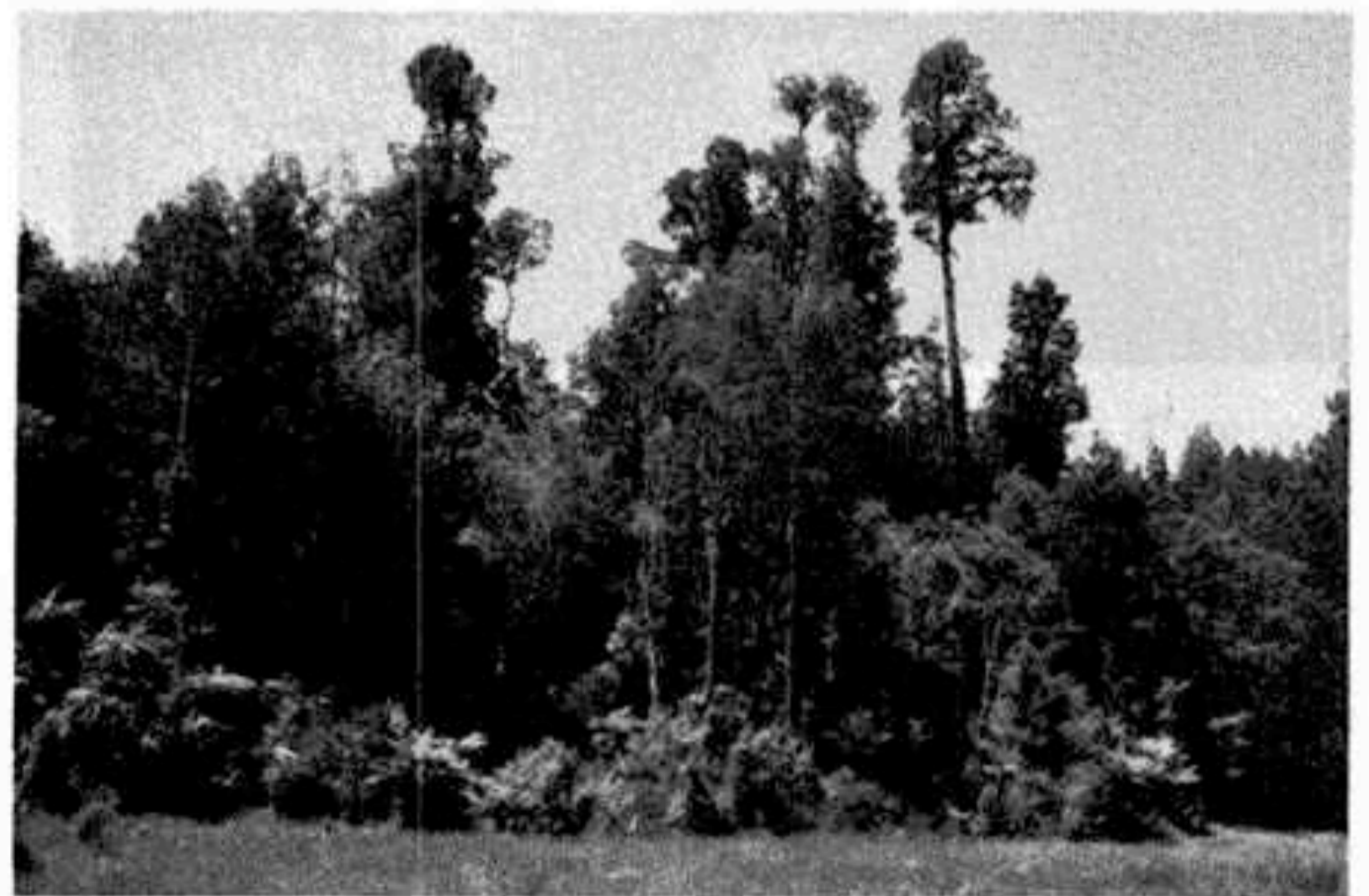
FIGURE 4. Stand of kahikatea, showing mature trees which have survived an episode of silting, and young trees which have grown subsequently. Ohinetamatea River.

The young kahikatea trees seem numerous enough to ensure that a dense stand will become re-established.