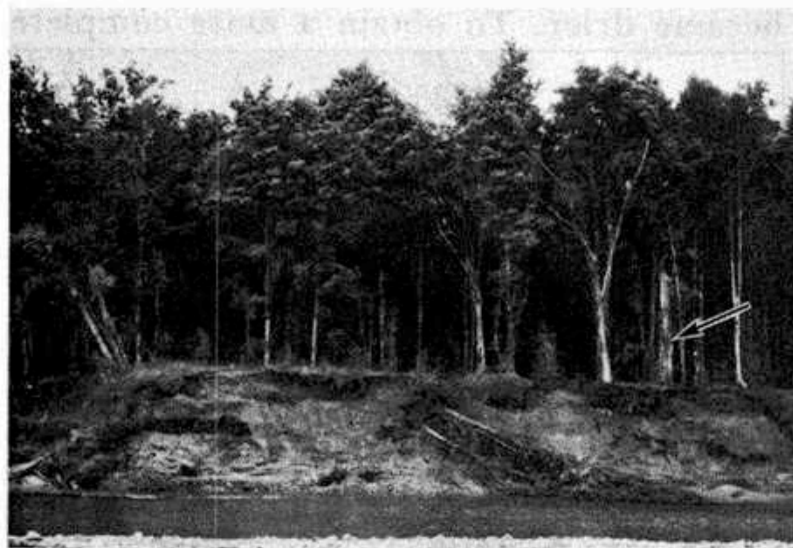
FIGURE 2. Young forest dominated by Podocarpus totara var. waihoensis on well-drained alluvium. The arrow shows a dead trunk from a previous forest overwhelmed during aggradation. Ohinetamatea River.

young forest on the stonier, better drained soils is often dominated by totara, which is dense enough to largely suppress the lower storeys (Fig. 2). In this community young kahikatea can be especially numerous; there are also seedlings of other lowland podocarps i.e. rimu ( Dacrydium