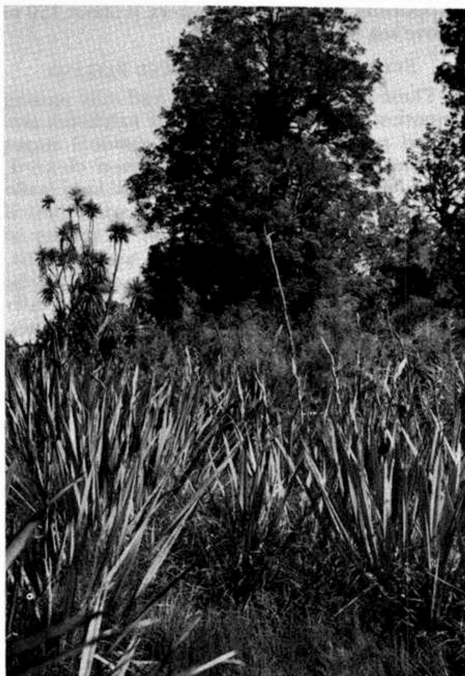
FIGURE 5. Kahikatea bordering on swamp dominated by Phormium tenax . Near head of Waitangiroto River.

The fertile sequence is most common where swamp forms a zone between forest and the open water of a lake or slow-flowing river (Fig. 5). Drainage tends to be into or through such swamps and the water is only mildly acidic (pH