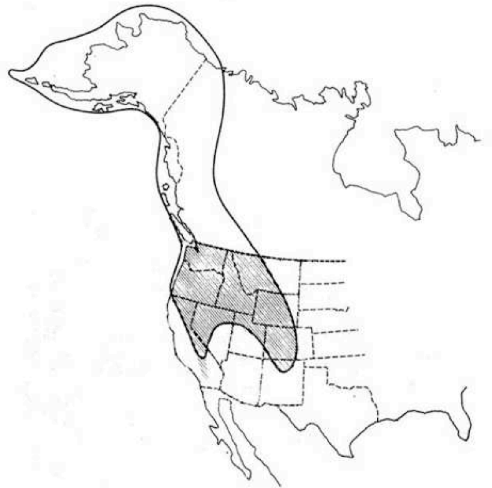
FIGURE 4. Distribution map of the hexaploid, R. eschscholtzii in western North America (continuous line). The diploid and tetraploid species are confined to the cross-hatched area. With the exception of R. oxynotus populations in southern California, the diploids and tetraploids occur within the geographical range of R. eschscholtzii .

R. adoneus (Fig. 3-f) occurs in the central Rocky mountains in Wyoming, southwards into Utah and central Colorado. It is found in open, exposed sites, receiving direct sunlight, and always occurs very close to patches of melting snow at high altitudes