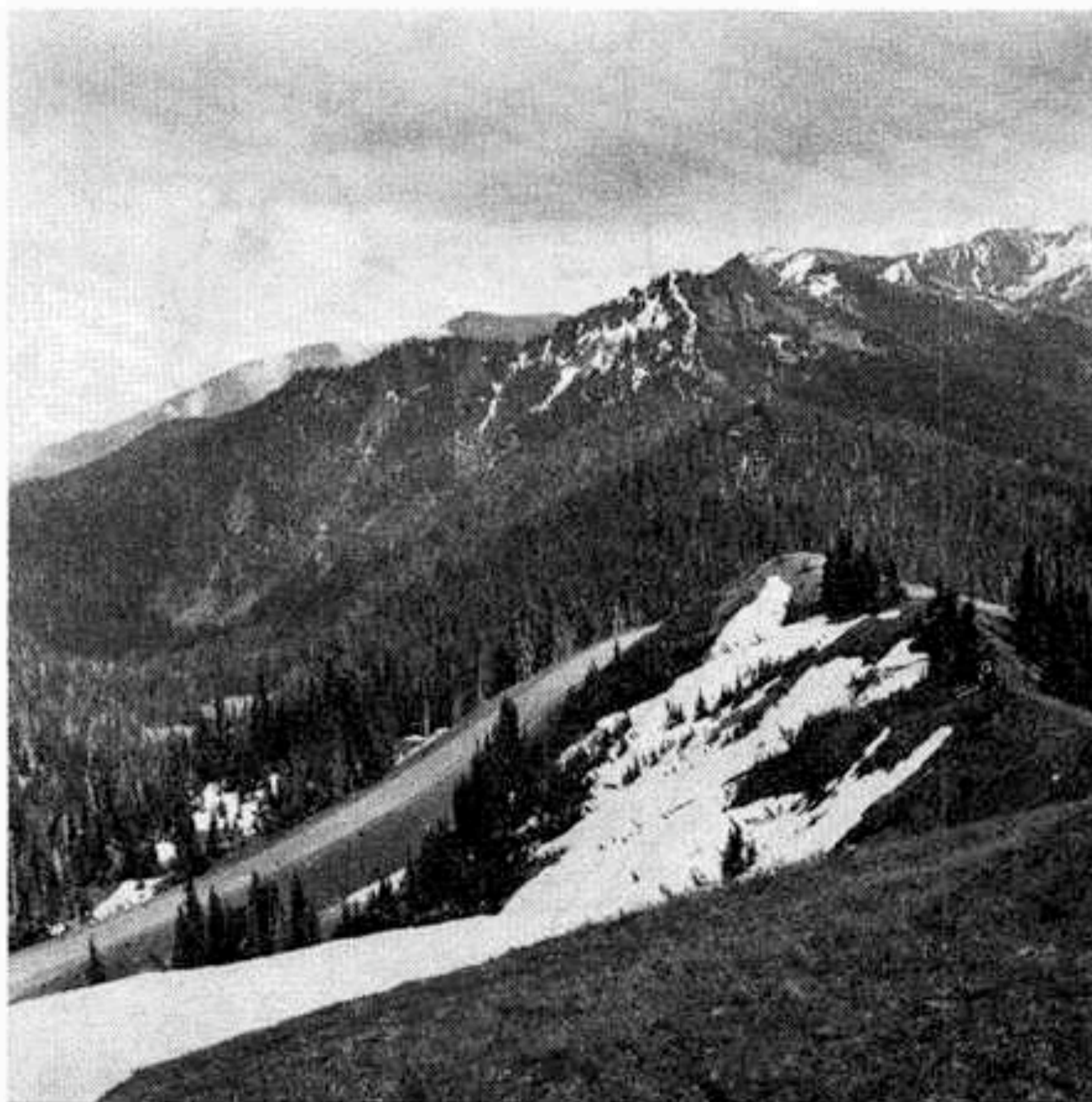
FIGURE 1. A snowbank habitat on the Olympic Peninsula, Washington, where Ranunculus suksdorfii subspecies suksdorfii occurs.

Snowbank plant communities (Fig. 1), at or above treeline in the mountains of western North America, from the Aleutian Islands of Alaska to southern California and New Mexico, usually contain one or