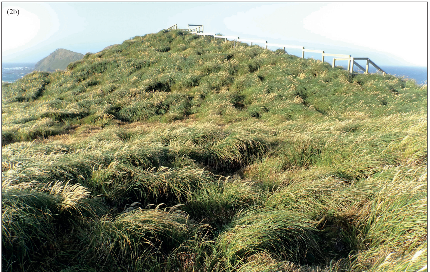
Figure 2. Razorback Spur at the base of The Isthmus on Macquarie Island, 54^{\circ}30'17.92''\text{S} , 158^{\circ}55'50.91''\text{E} . Photos taken April 2005 (2a) prior to and March 2014 (2b) since the removal of invasive rabbits illustrate the scale of vegetation recovery underway in the absence of grazing animals.