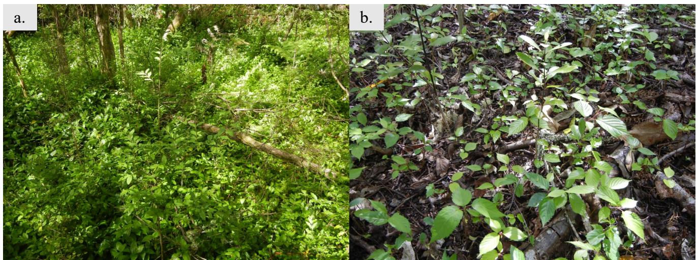
Figure 3. Examples of Scenario C, woody weed species regenerating under their own canopy: a) Chinese privet ( Ligustrum sinense ), b) Taiwan cherry ( Prunus campanulata ).

This is the worst-case scenario from a conservation perspective: the canopy weed is likely to persist indefinitely under current conditions, with no chance of native succession. Examples of woody weed species in New Zealand that have been observed to have an understory resembling Scenario C (at least at some sites) include sycamore, tree privet, Chinese privet (Fig. 3a), and Taiwan cherry (Fig. 3b) (KGM pers. obs.; McAlpine et al. 2018). The same principles should apply in mixed species woody weed stands; species regenerating in the understory are most likely to persist.