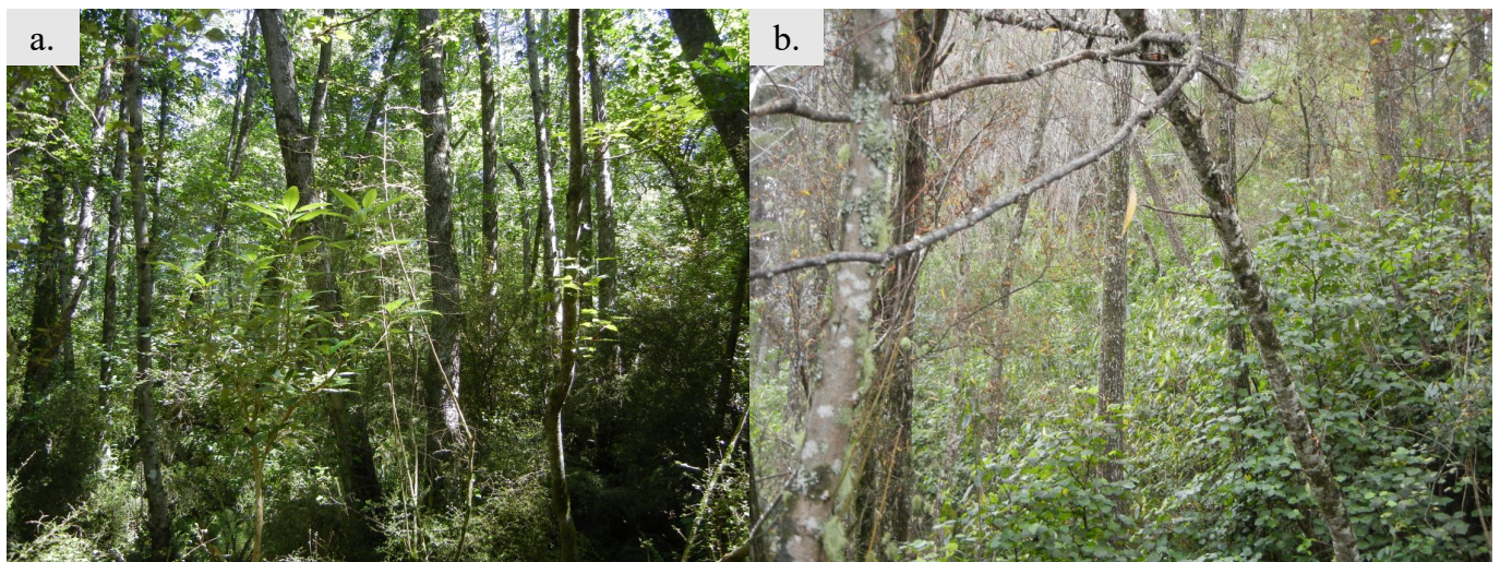
Figure 2. Examples of Scenario A, woody weed stands with a dense native understory: a) alder ( Alnus glutinosa ), b) silver willow ( Salix alba ).

This is the best-case scenario from a conservation perspective. Providing disturbance does not occur, the long-term successional trajectory at these sites is likely a return to native dominance: natives will gradually take over as the adult weed plants senesce. There is much anecdotal, and some empirical, evidence that many woody weed species can be replaced by native plant succession in New Zealand, with gorse being the best known example (Smale 1990; McCracken 1993; McQueen 1993; Wilson 1994; Williams 2011). The resulting vegetation may not be exactly the same composition as succession through natives (Sullivan et al. 2007), but any mix of natives is presumably preferable to exotic domination, particularly if it can be achieved 'for free'. Missing native species could be added later, for example by planting saplings or sowing seed (Overdyck et al. 2013; Forbes et al. 2020).