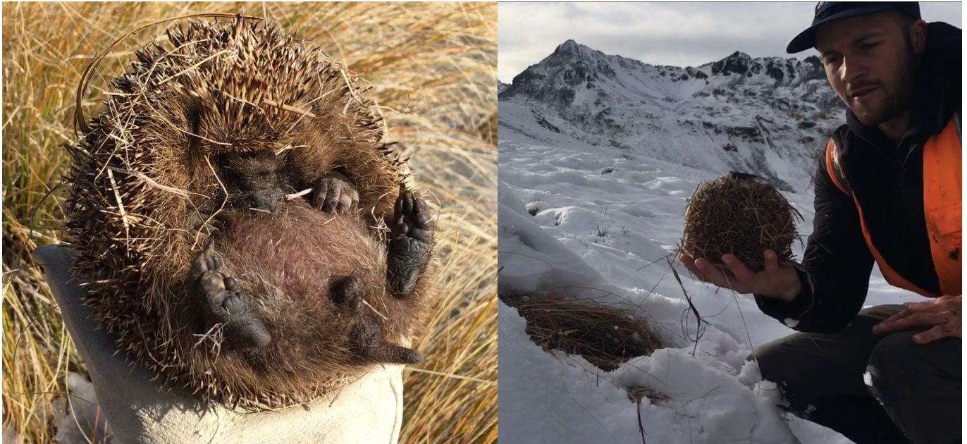
Figure 3. Hedgehog #5 exhibiting signs of partial arousal from hibernation at 1750 m on 30 April 2020 (left), and hedgehog #3 found denning at 1608 m a.s.l. beneath undisturbed snow on 31 May 2020 (right).

before snow was present in the study area. At this time, body weights of the six tagged hedgehogs ranged from 528–816 g (mean = 663 g). Although mean 24 h temperatures dipped below 5°C on several occasions between 15 January and 15 March, they typically ranged from 10–17°C. The mean 24 hr temperature exceeded 10°C on only two occasions between 15 March and 30 April.