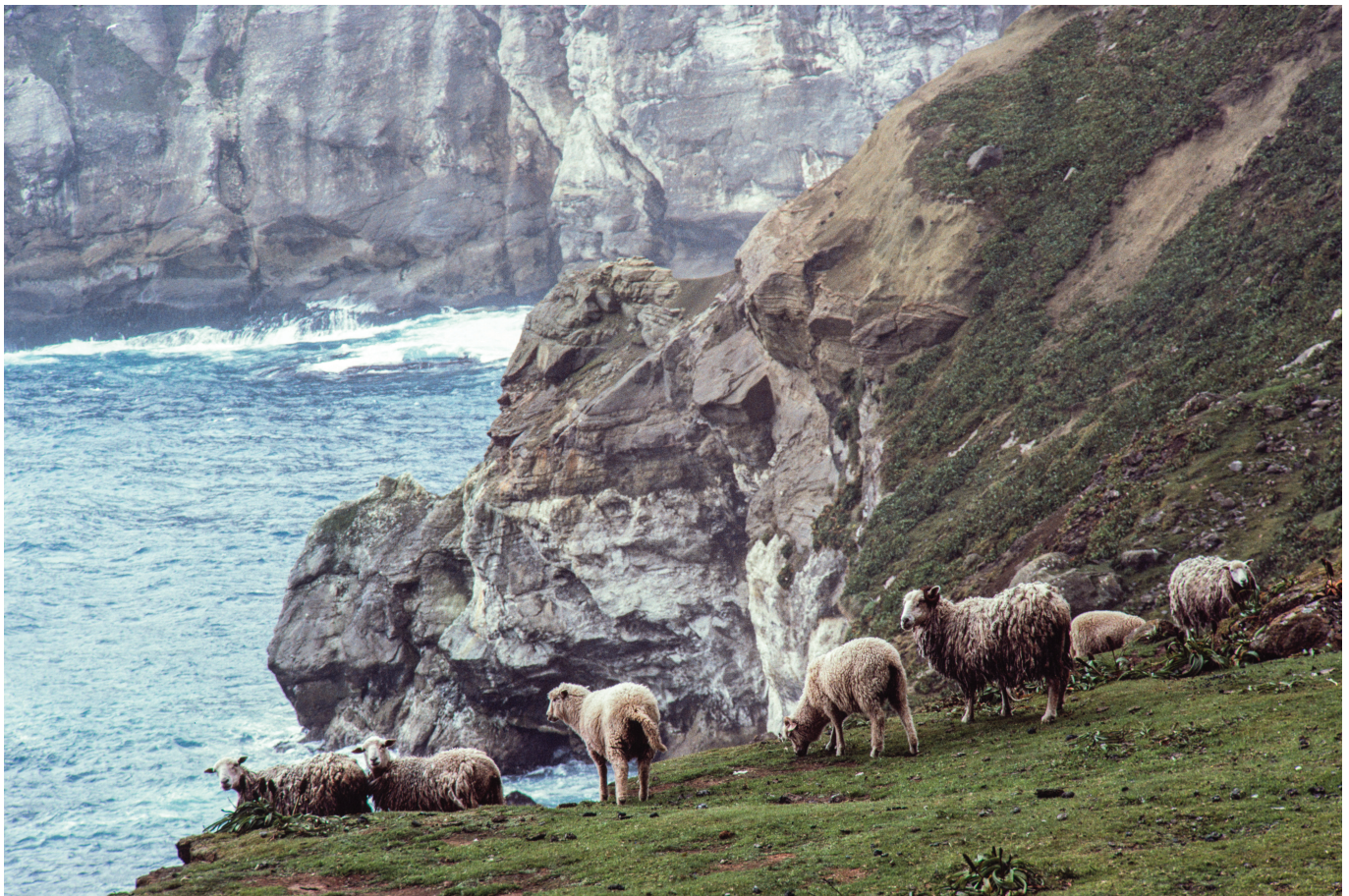
Figure 1. Feral sheep at Penguin Bay, Campbell Island, with a fine turf of cropped grass in foreground and unpalatable Bulbinella rossii in the background.

Some concern was held over the effect of sheep on albatross numbers and breeding success (Guthrie-Smith 1936; Westerkov 1963); while counter views suggested the opening-up of dense tussock made more nesting sites available (Sorenson 1950). Much later on, the effect on albatrosses was largely dispelled.