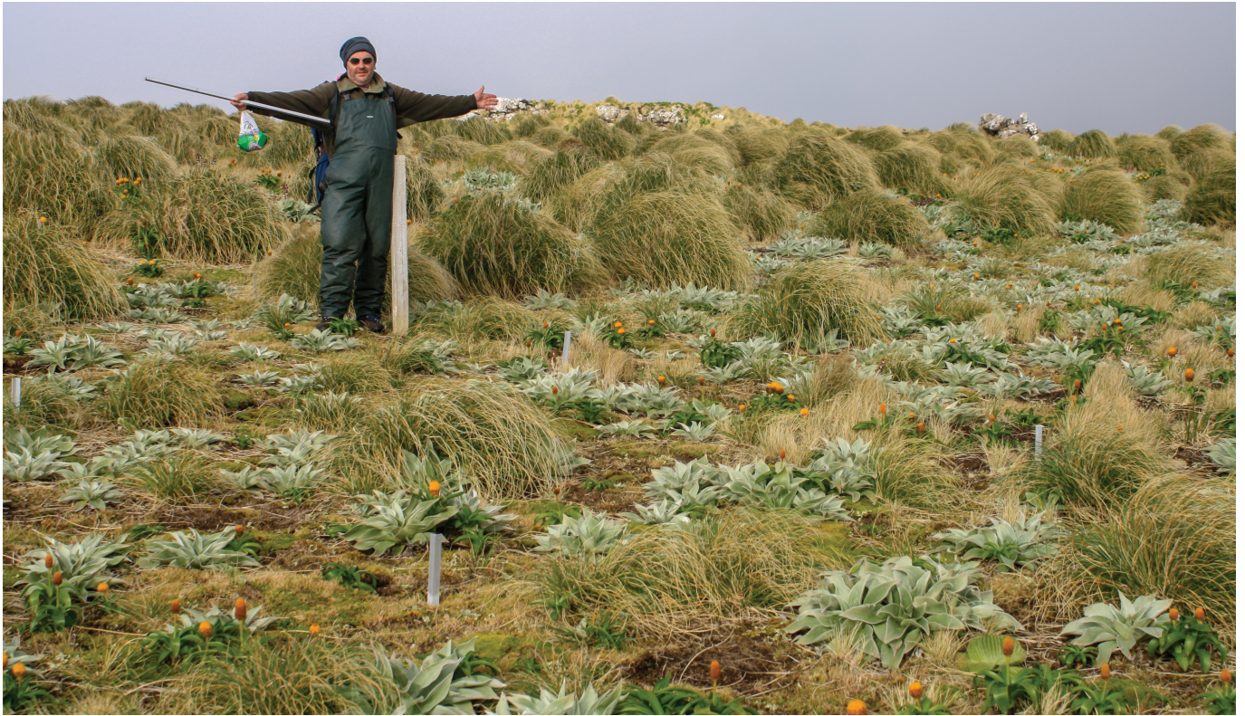
Figure 3. Colin Meurk in 2010 (facing south) indicating the position of the 1970 fence line that bisected the island and removed feral grazing pressure from the northern half of the island (in the background) 14 years before the vegetation in the foreground, which had been ungrazed since 1984 (17 Dec 2010).