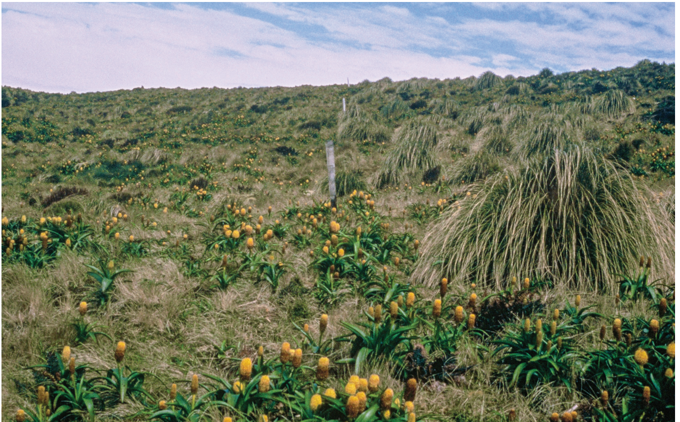
Figure 4. Posts indicating the position of the 1970 fence line in 1996. Sheep had not been present in the southern section (to the left of posts) for 12 years, compared to 26 years on the right. Chionochloa antarctica tussock has not yet strongly re-established in the southern sector, compared to the strong recovery in evidence to the right.