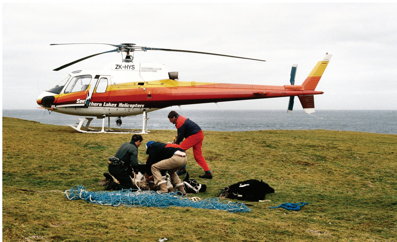
Figure 7. Capturing Enderby cow, Lady, and her calf on Enderby Island, 1993.