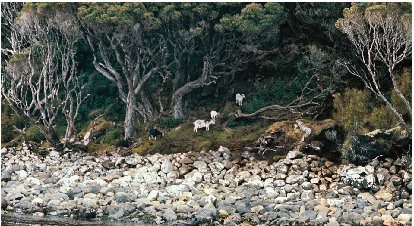
Figure 2. Goats at Port Ross, Auckland Island, 1976.

A preliminary report on these goats by the Animal Science Group (1986) at Lincoln College noted that they ranged in colour from black to white-grey (although some pure white