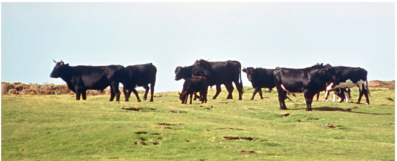
Figure 6. Feral cattle at Sandy Bay, Enderby Island, 1972.

Shipwrecked survivors of the Dundonald found “plenty of cattle on Enderby and Rose Islands” in 1907 (Otago Daily Times 1907). In April 1910 a visitor to Enderby Island reported that “About 100 head of fine, upstanding cattle were contentedly browsing there” (Waikato Independent 1910) but a few months later in November 1910 another visitor described them as “a good number of cattle—over 100 head—but they were poor looking mongrel beasts” (Southland Times 1910), and in 1916 an editorial paragraph on the Otago Daily Times (1916) was devoted to the “shocking state of affairs among the cattle on Enderby Island” which were in a weak emaciated state. Varying reports followed, but by 1931 the cattle were described as being in good condition (Otago Daily Times 1931). During World War Two there were two coast watching stations on the Auckland Islands, and wild cattle on Enderby Island were slaughtered to provide fresh meat for them (Press 1945; Turbott 2002).