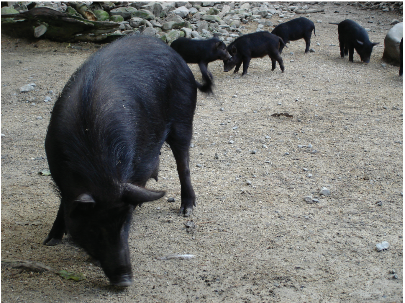
Figure 10. Auckland Island sow with piglets at Staglands Wildlife Reserve, 2007.

longer than usual, and several had almost woolly ears, all of which could be considered to be advantageous in the cold and harsh environment that they had been deposited into, and had to adapt to.