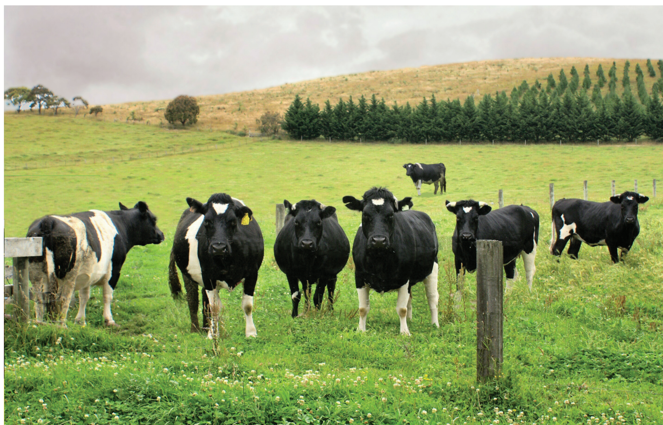
Figure 8. Enderby cow Lady in the background, with two of her clones on the left plus their purebred offspring, Matheson property, 2007.