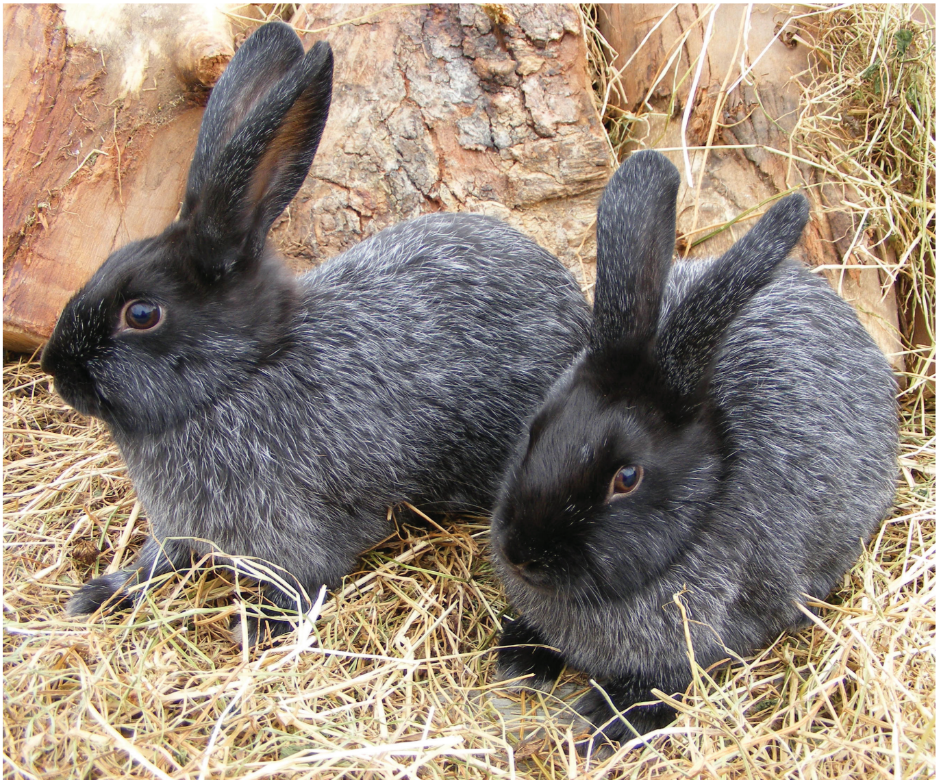
Figure 5. Silver-grey Enderby Island rabbits in Canterbury, 2008.

As with any such venture, a considerable amount of research and preparation was required. The transport of wild rabbits can be fraught with difficulty, and in some cases 100 percent losses have been experienced, mostly due to a low tolerance of stress. To eliminate the emotional tension, they took a cocktail of sedatory drugs, along with travelling