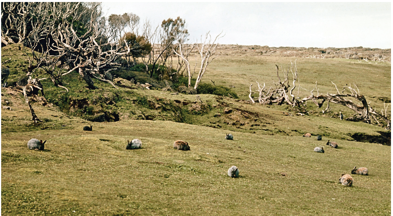
Figure 4. Feral rabbits on Enderby Island, 1973 (Photo: HA Best, Department of Conservation).