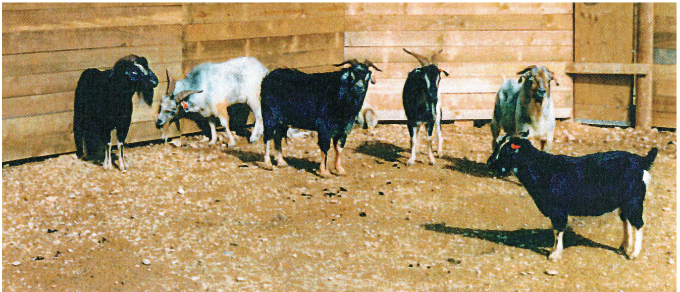
Figure 3. Auckland Island bucks at Eyrewell, North Canterbury, 1986.

had been seen on the island). Blood typing showed a marked difference in terms of serum albumen and transferrins from the feral and Anglo-Nubian goats held at Lincoln. Their plasma protein characteristics were similar to Spanish Serrana Andaluza and Hungarian Saanen goats. The Lincoln Animal Science Group report concluded: “It is clear that in spite of an inhospitable climate individual goats appear to be well adapted for survival on the Auckland Islands although the population as a whole may be limited by neo-natal mortality. Those goats which survive to maturity are large framed animals which appear to be genetically different from New Zealand feral goats. It is possible that under intensive farming conditions these goats may produce offspring of exceptional size, and good nutrition and selection could be expected to increase Cashmere [fine undercoat] production. We feel that these goats warrant further study, both as a source of new genetic material and as a physiologically adapted population that have evolved over 100 years in a harsh climate. It would be unwise to eliminate this population completely since it is difficult to have the foresight to know what characteristics may be required of farm animals in the future” (Animal Science Group 1986, p. 4).