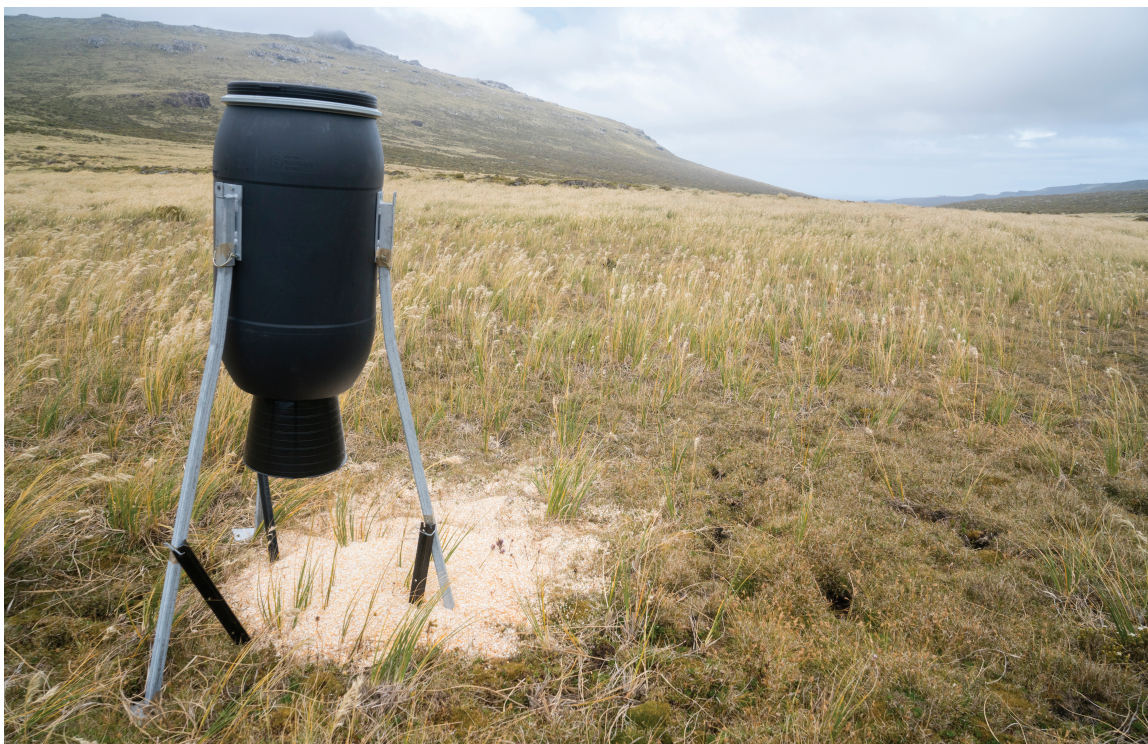
Figure 2. Pig feeder installed on open tops above Smiths Harbour, Auckland Island during summer 2019. Note the wind-blown maize underneath demonstrating the exposed nature of the site (Photo: FSC).

Improving on commercially available feeder design, custom feeders were constructed for this research to improve usability and durability (Fig. 2). Components were watertight plastic 125 L drums with lids, three removable steel legs with lifting points, All-in-one Deer Feeder Timer Kit™ (Moultrie, Moultrie Feeders, Alabama, USA), and a malleable bucket to direct feed below the feeder. Feeders were secured to the ground with Waratahs (Summit Steel & Wire, Auckland, NZ) fixed to each leg and angled in different directions. The feeders were set to feed c. 2 kg of kibbled maize each day. In the summer, feed was dispensed once per day at 17:00 h (c. 5 h before sunset); in winter c. 1 kg was applied twice per day, once at 07:00 h and again at 18:00 h (c. 1 h after dawn and c. 1 h before dusk respectively). The feeders were set by timer rather than feed weight. Flow rates were tested before installation to find the appropriate length of time to dispense bait to achieve the target weight (in the winter this rate was 13 s for 1 kg of feed). The feeders had ample capacity for the trial period.