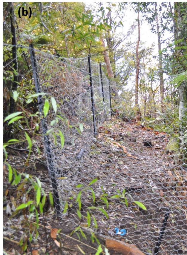
Figure 3. A fence constructed with a fine wire mesh, capped, and topped with an electric wire has been used at Riccarton Bush, Christchurch, to exclude invasive mammal predators such as brushtail possums, stoats and rats (a). Simpler fences constructed with a coarse wire mesh have been used in Te Urewera to exclude invasive mammal herbivores such as deer (b). Such fencing treatments are widely deployed for animal exclusion but often exclude non-target species, have been located subjectively, treat a small area, are subject to periodic breaches, and potentially influence ecosystem-level responses (e.g. seed production and litter fall).