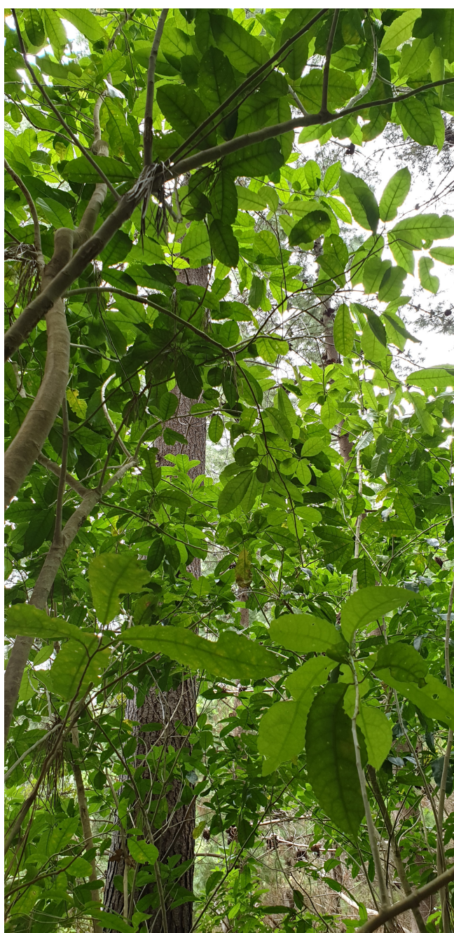
Figure 2. Early successional indigenous species regenerate beneath the canopy of an 18-year-old Pinus radiata forest in the Marlborough Sounds, Aotearoa.

Afforestation with exotic pine trees will likely have below-ground impacts which could potentially influence the regeneration of native flora. Pinus radiata established on pasture can lower the pH of the soil at all levels. It can also reduce topsoil mixing through a reduction in earthworm activity. However, afforestation has been found to increase