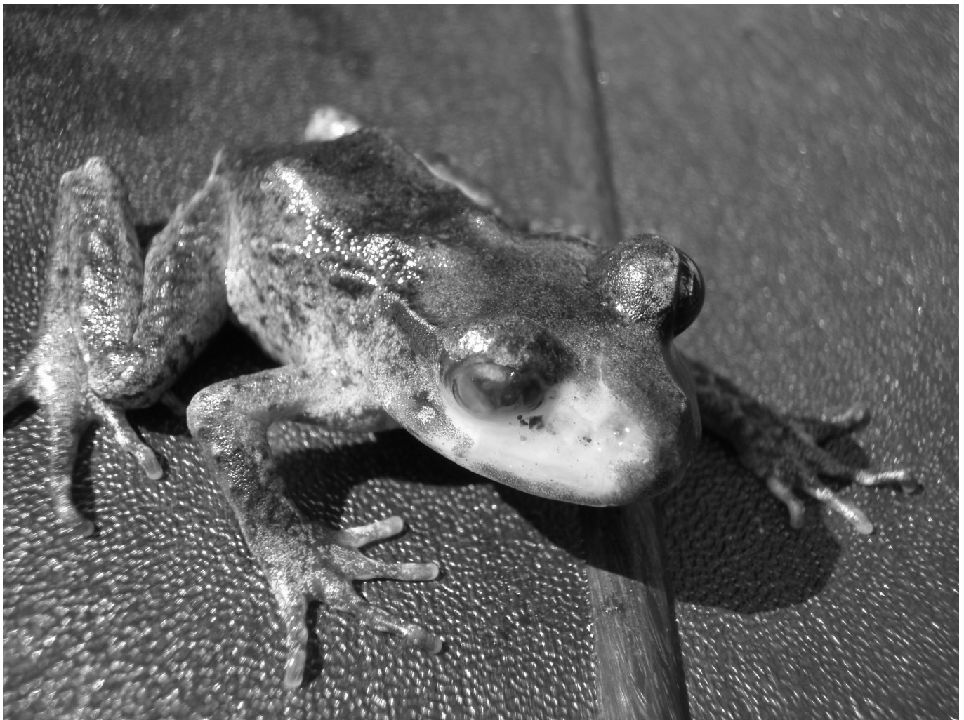
Figure 3. Photograph of a translocated frog showing severe injuries to the face, including damage to the eye and a missing portion of the top jaw, possibly due to a predation attempt.